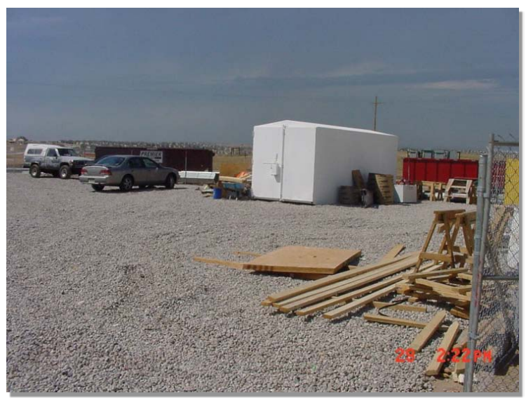
Photograph SSA-1 . Example of a staging area with a gravel surface to prevent mud tracking and reduce runoff.

Most construction sites will require a staging area, which should be clearly designated in SWMP drawings. The layout of the staging area may vary depending on